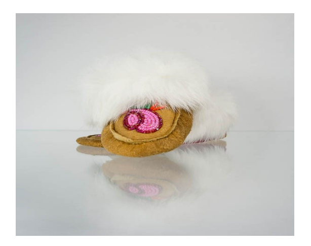
The Urban Aboriginal Healthy Living Program (UAHLP) can help you achieve your lifestyle goals!

This program is taking major strides to help community members to increase their physical activity levels and their cardio-vascular health; to become smoke-free; to increase their knowledge of nutrition, healthy eating practices and weight management; and to enhance the leadership ability of our youth.